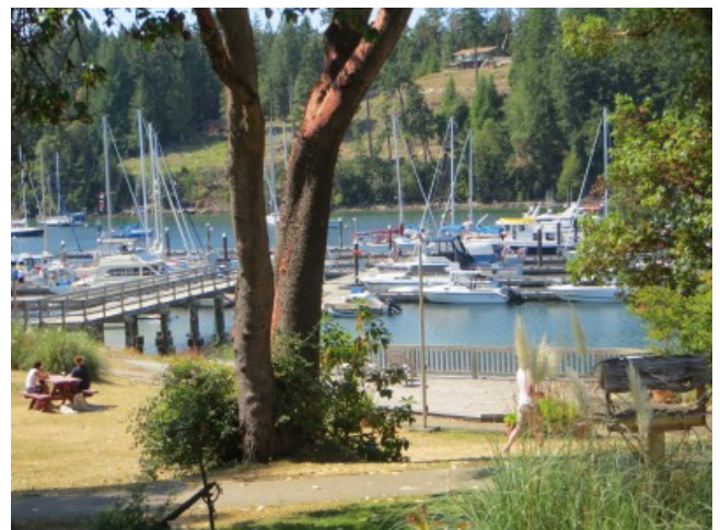
Telegraph harbor marina.