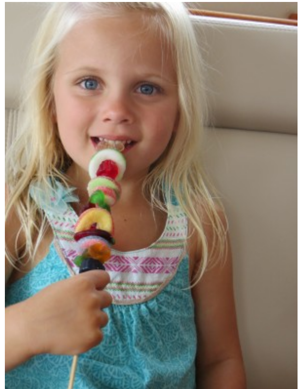
Ava's gummy skewer