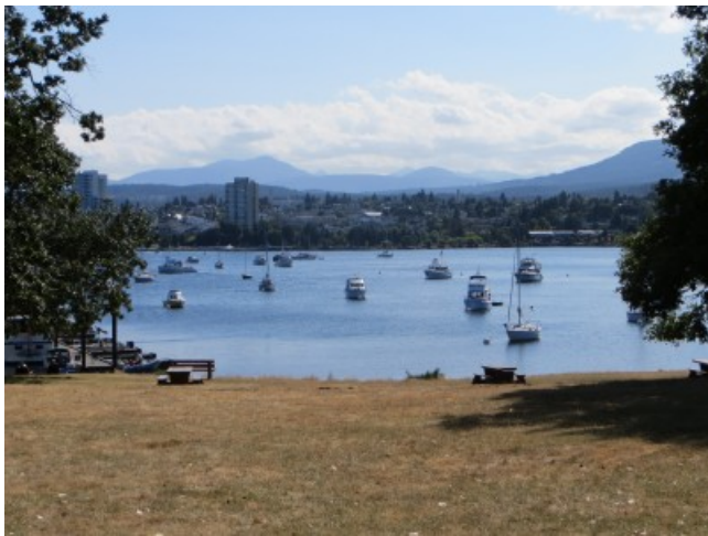
View of Nanaimo from Newcastle Island