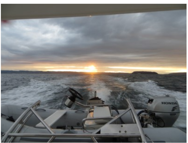
The sun going down!