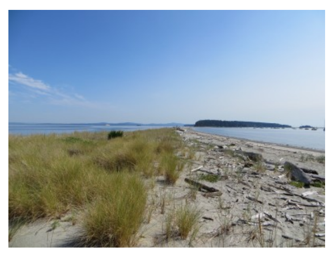
The spit looking south toward Sidney Island