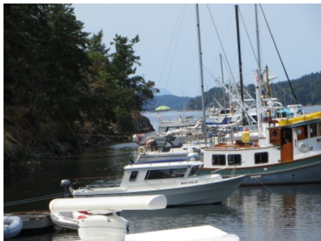
All the boats lined up and stern tied