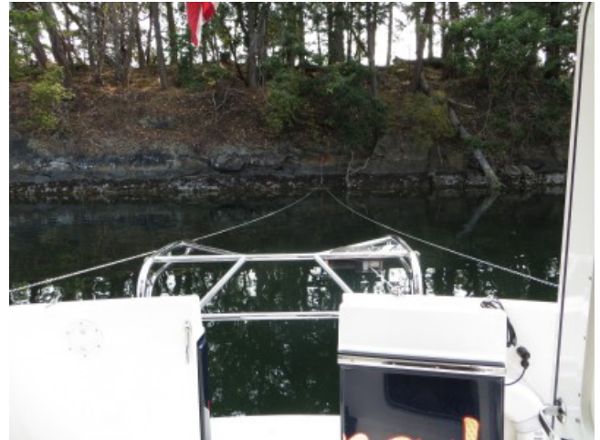
Our boat stern tied to shore