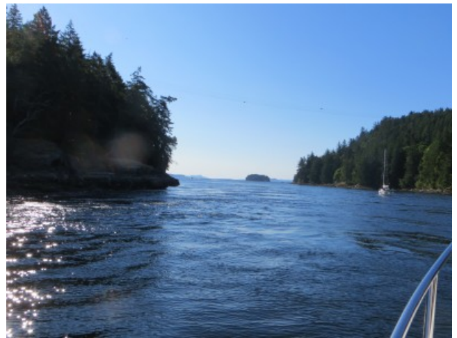
Back through Dodd Narrows