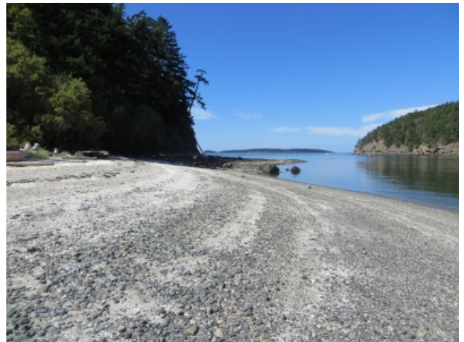
The beach at Little Sucia