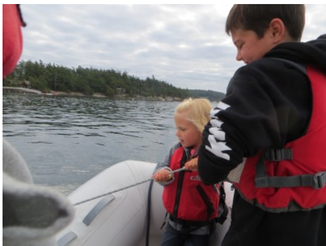
Pulling up the crab pot!