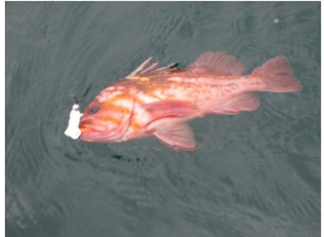
One of Skylars fish