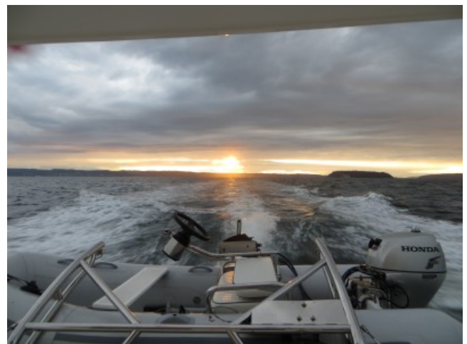
The sun going down!