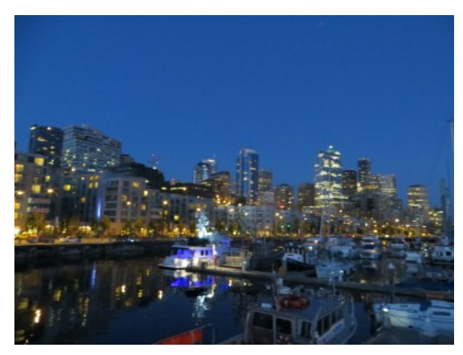
Seattle skyline from the marina