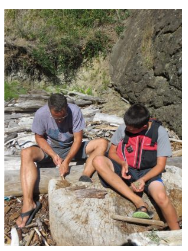
Almost got a fire going using only sticks