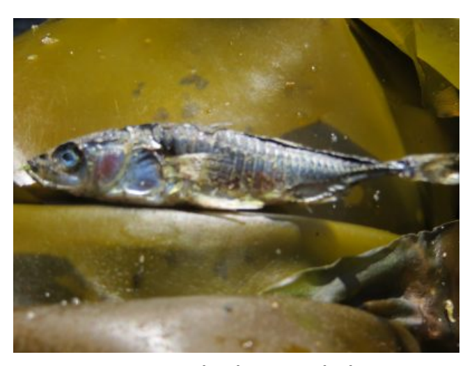
Dried up Fish