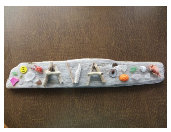
Ava's Plaque with treasures