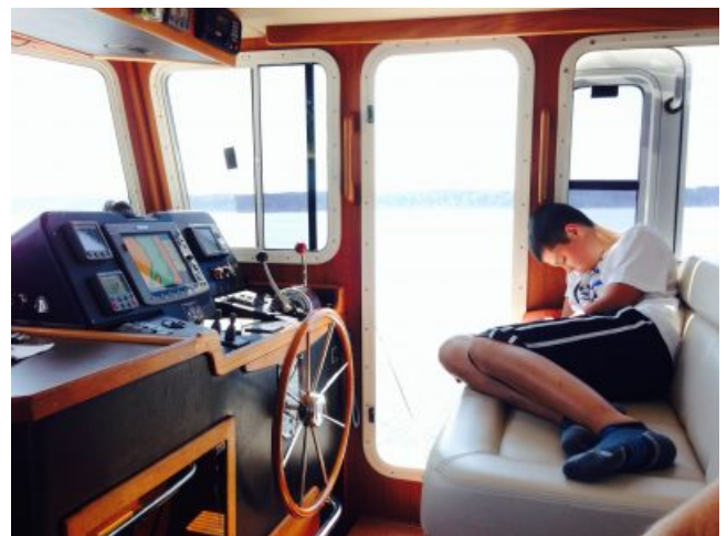
My Co-Capitan on Watch