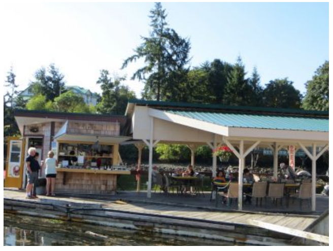
Genoa Bay Breakfast Bar on the docks