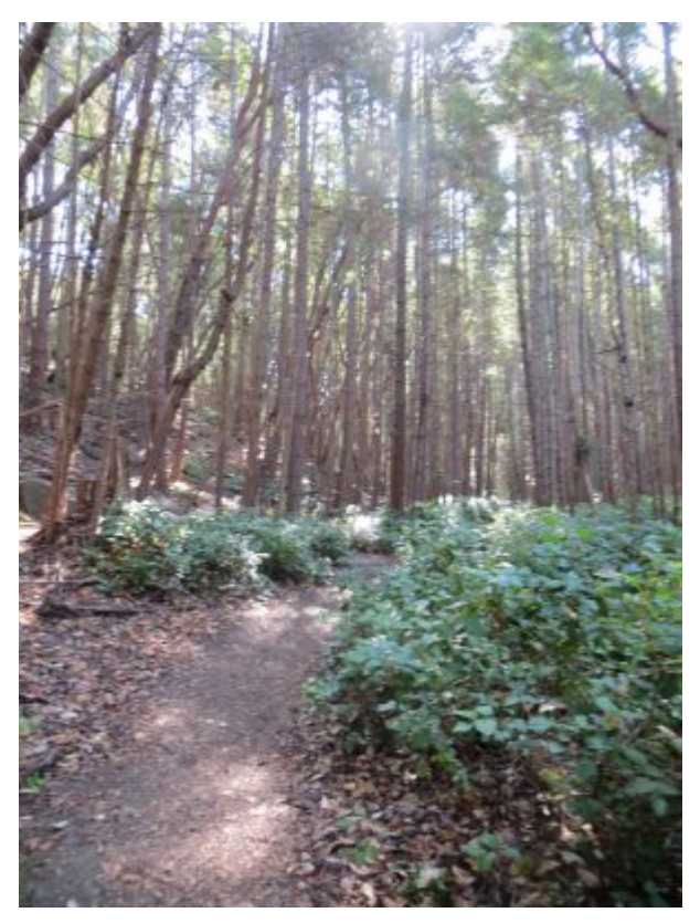
Wallace Island trail