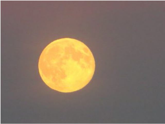
The super moon