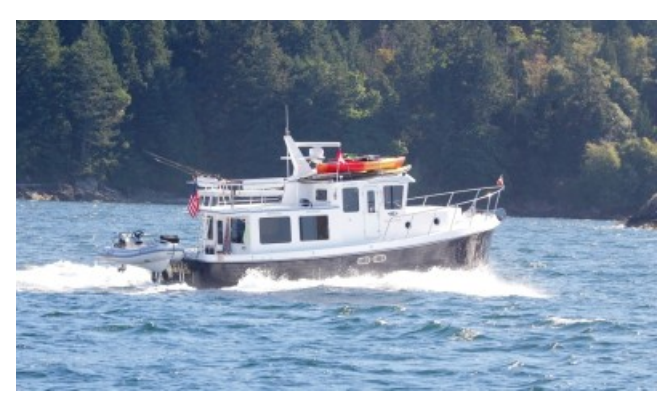
Kama Hele on the move!