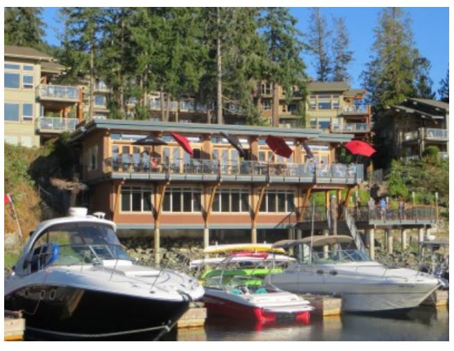
Pender Harbor, Painted Boat