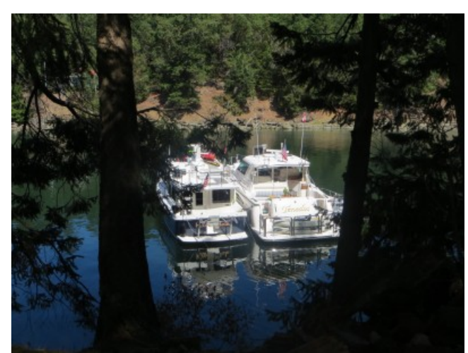
Stern tied on Wallace Island