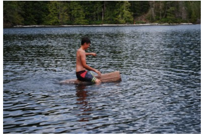
Kids playing in lake