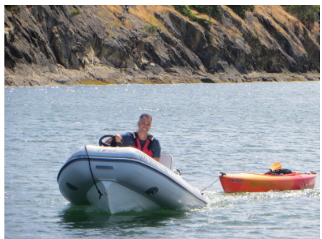
Pulling the kayak back to