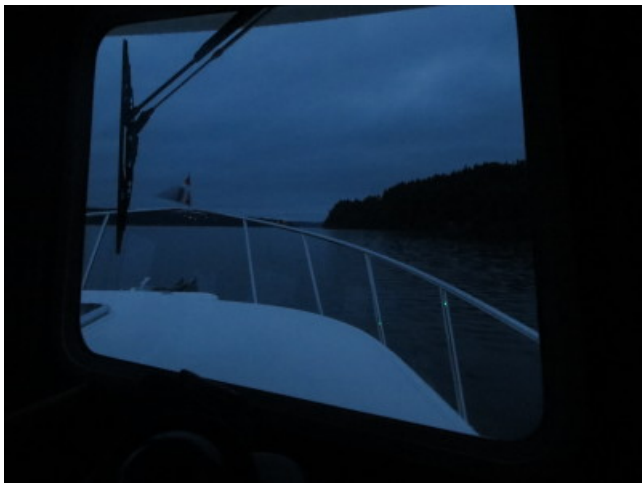
Early morning departure

At 3:10pm and 10 hours 42 minutes run time we arrived to find the lone buoy in Matia's Rolfe Cove available for us to snag. As tired as we were we knew the kids had to run, so we took the dinghy to shore for a little hike around the island. Dinner and bed could not have come sooner!