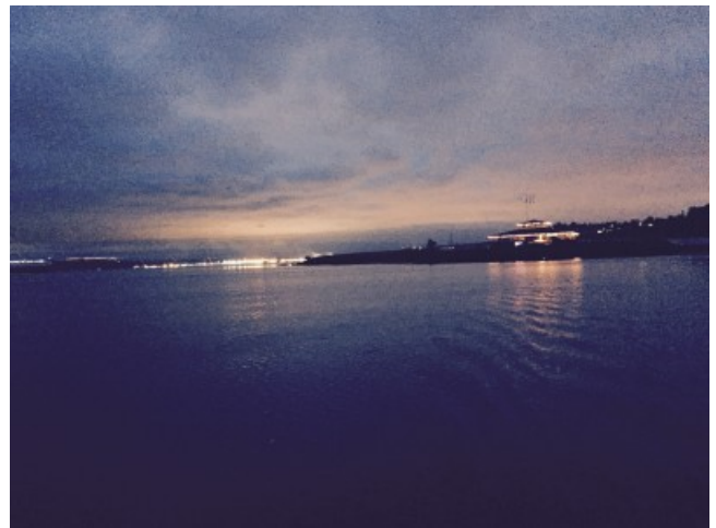
Tacoma at 4:30am