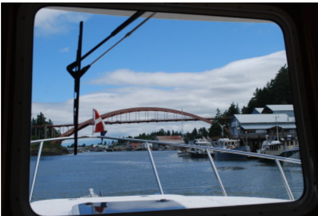
Arriving in LaConner