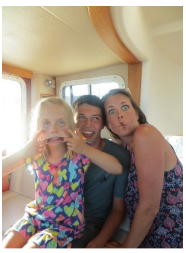
They have gone crazy!