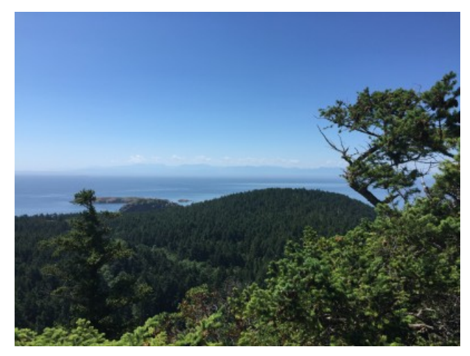
View from the hike

docks. Dinner at the LaConner brewing company was great and we all had fun walking around the town.