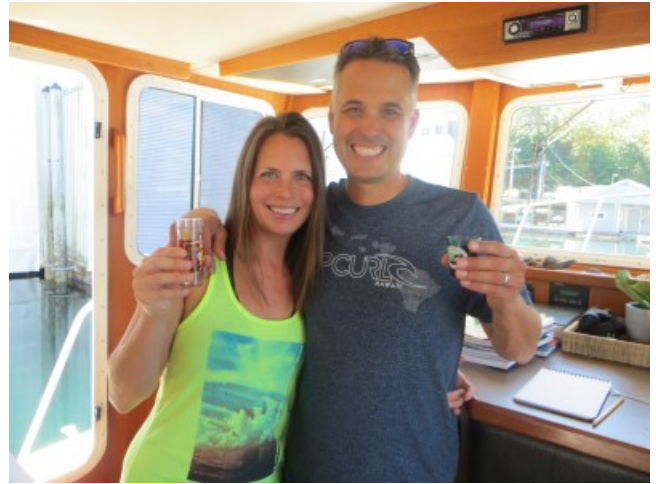
A celebration shot for the kick off