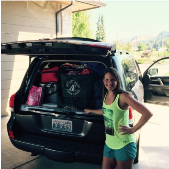
All packed up!