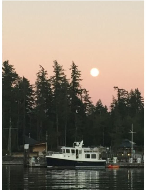
Thats the moon rising over our boat