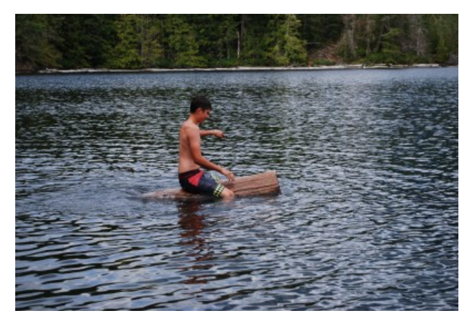
Kids playing in lake