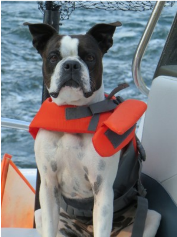
Proud Lilly the dog