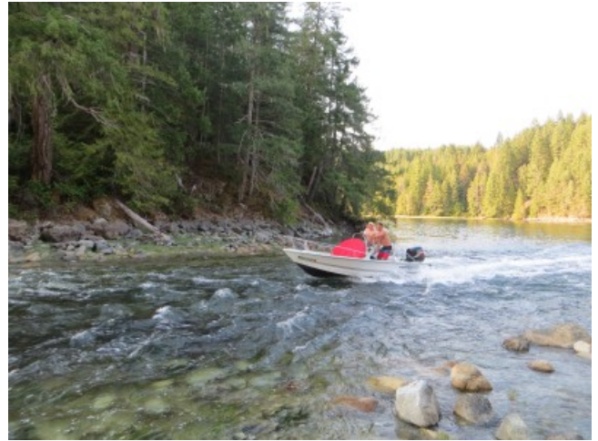
We didnt make it!