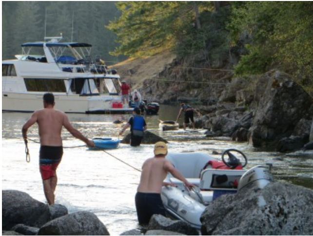
Pulling the dinghy through the rapids