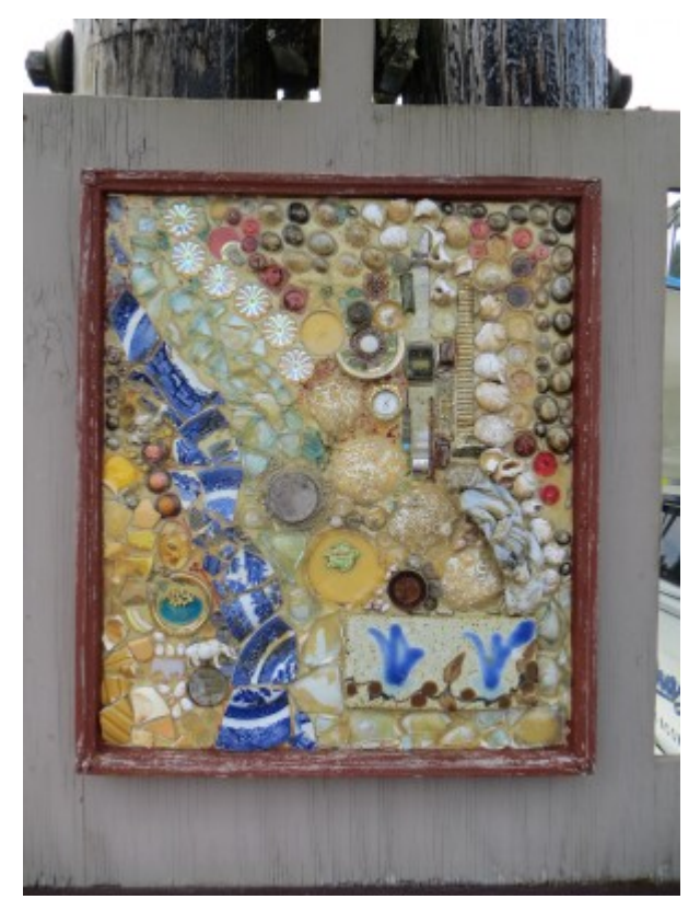
Sea art at Blind Channel