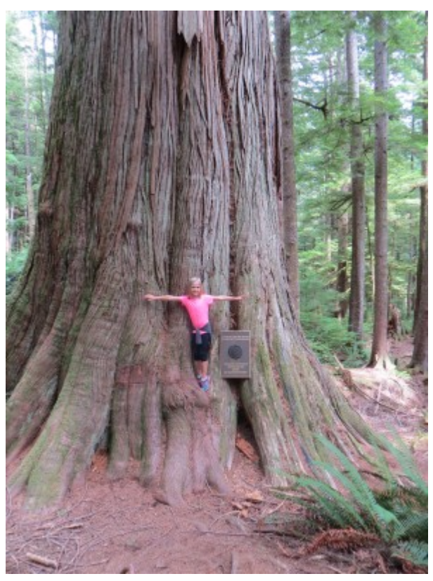
The big tree!