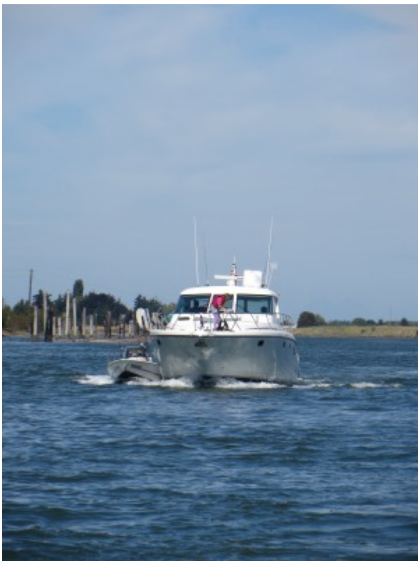
Leaving La Conner