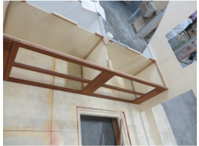
Guest stateroom bunk