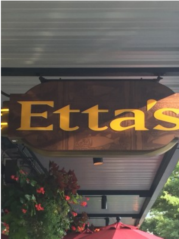
One of our favorite resturants