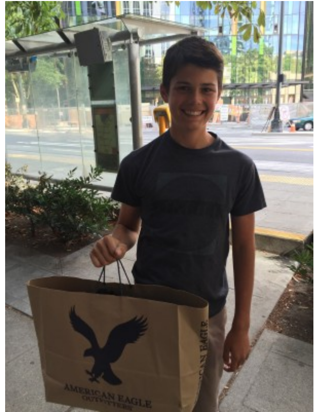
School clothes shopping