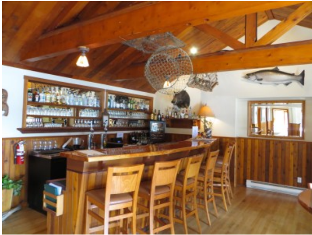
Dent Island Bar