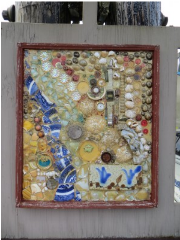
Sea art at Blind Channel