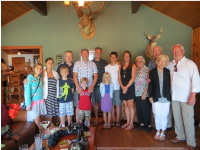
The whole crew