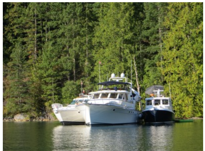
Our 3 boats rafted up