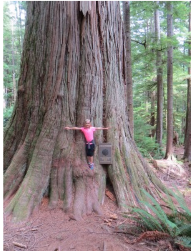
The big tree!