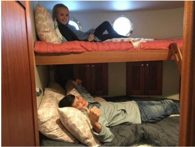
Kids are loving their bunk