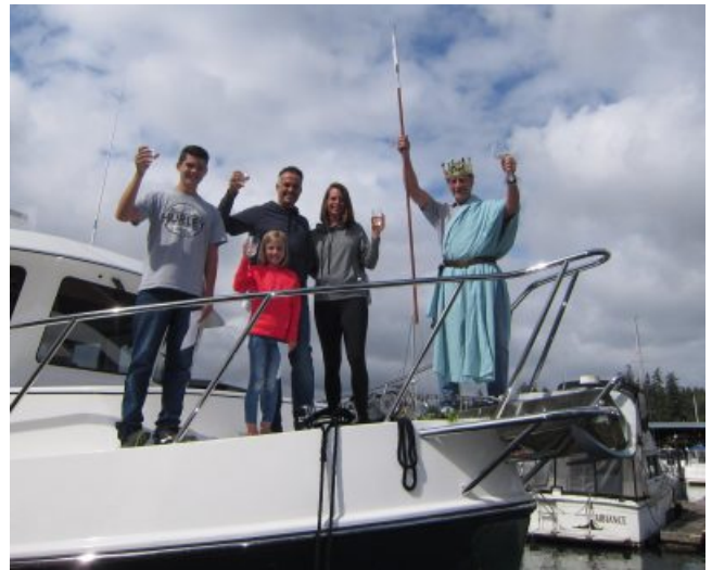
King Neptune christening the boat