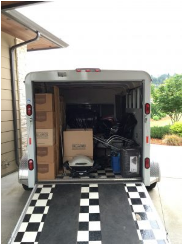
Our trailer all packed up with our boating stuff off the old boat.

great memories on this amazing boat. Thank you to all who put so much work into the construction and design process!