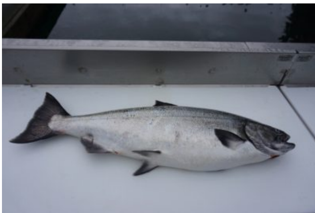
Skylars on the board for the Tyee Club