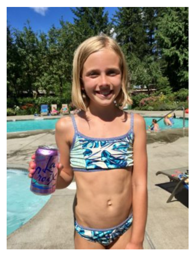
Pool time at Gorge Harbor