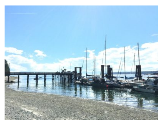
Manson Bay public dock