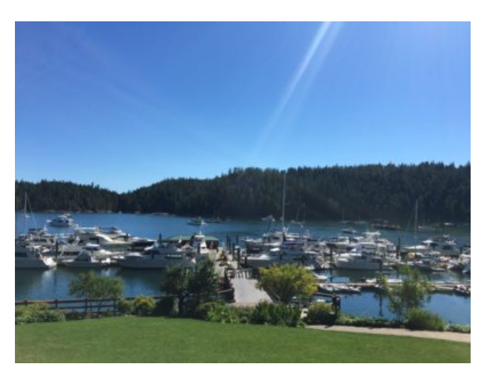
View of Gorge Harbor