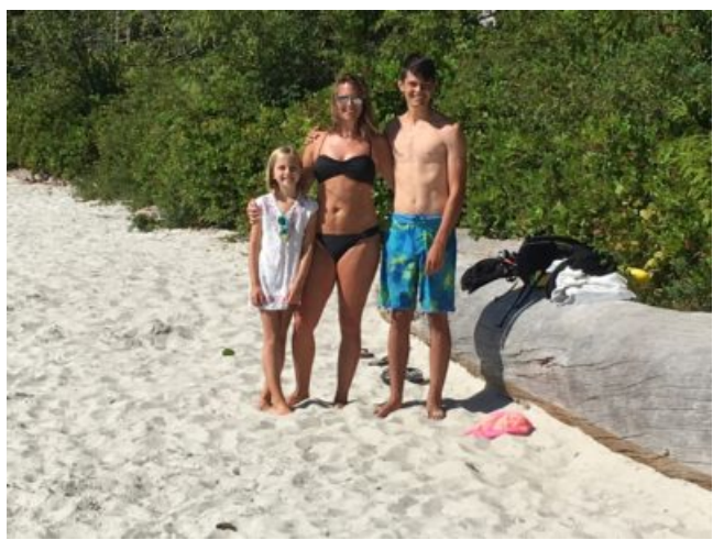
White sand beach at the lake