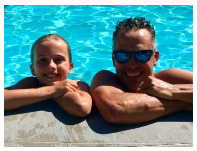
Fun in the pool