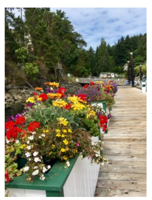
Otter Bay docks