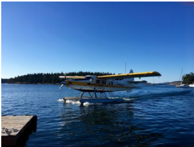
Johnny's float plane coming in