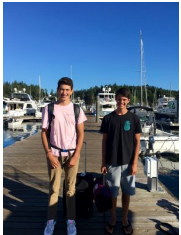
He made it!