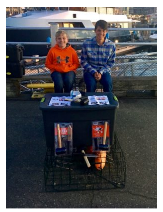
Great setup, but unfortunatly a bust