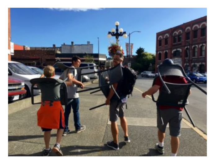
At least we had a place to sit