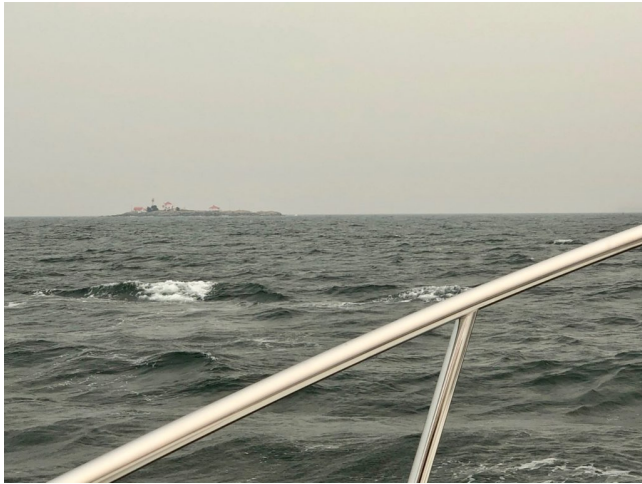
Long run down the Georgia Strait