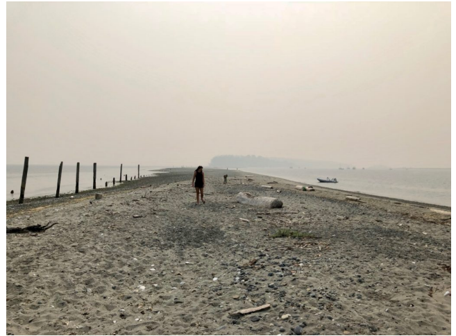
Sidney Spit in the smoke