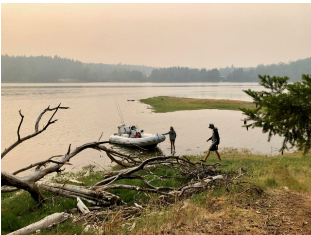
We took a trip to check out some friends property on Henry Island.