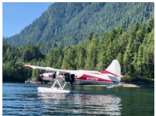
The boys arrived