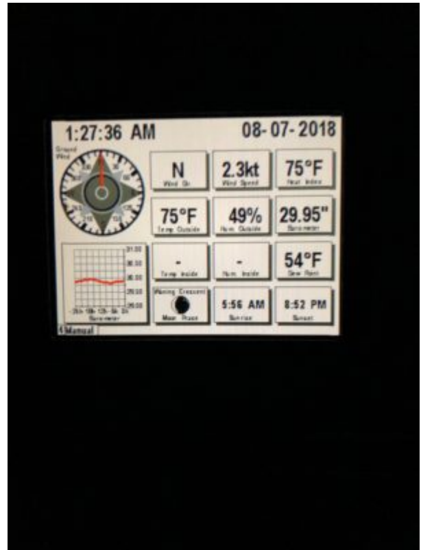
Notice the time, 1:27am and its still 75 degrees outside