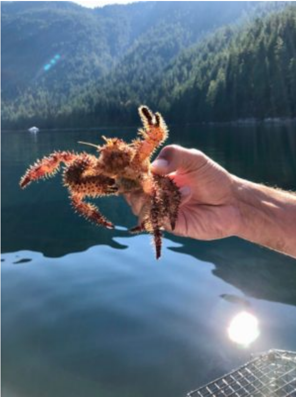
Weird crab thing in the shrimp pot

The rest of the day was spent swimming, shrimping and relaxing in the heat and the new kids had fun exploring the area.