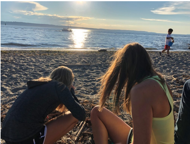
After docking at in Edmonds we walked to the beach