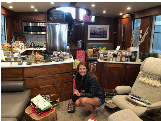
The stock up

Arrived in Edmonds, ego shattered, but a beautiful night on the docks.