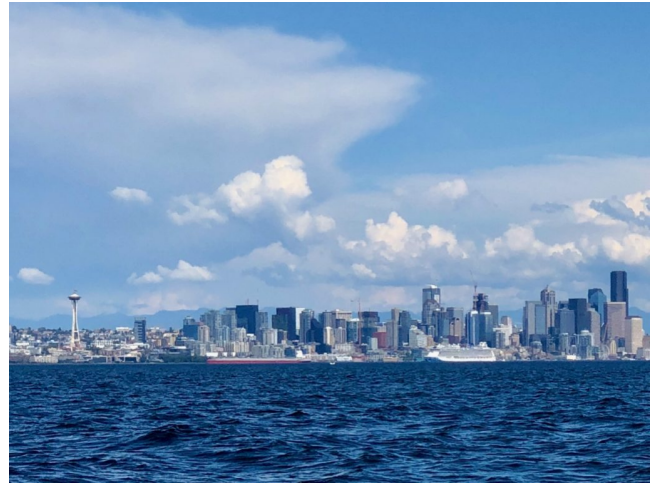
Cruising past Seattle on the way to Edmonds