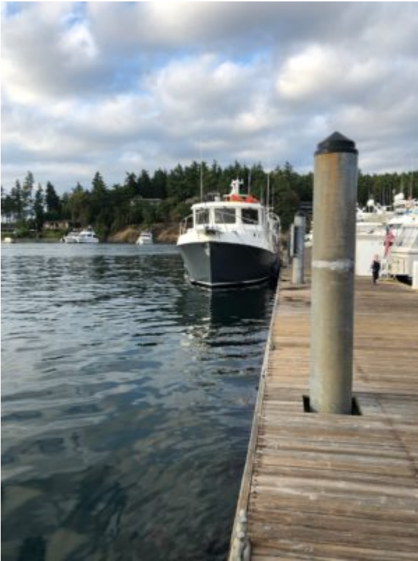
Our new Spot on the dock