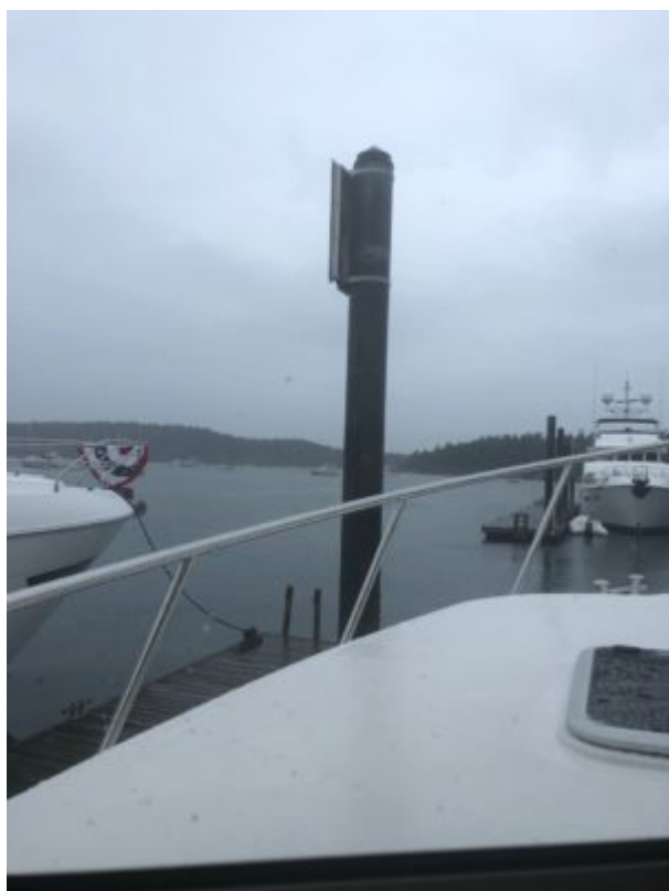
The rain coming down right as we left our slip

We had a nice time meeting up with some friends who were staying at the Seattle Yacht Club docks, then at 10:30pm the show started. The fireworks barge was right in front of our boat. It was incredible, we sat on top of our boat with an unobstructed view of a long, loud and brightly lit show. Super fun and a great way to celebrate Independence Day!