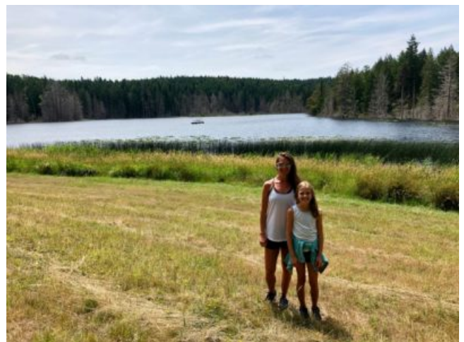
Roche Harbor Lake