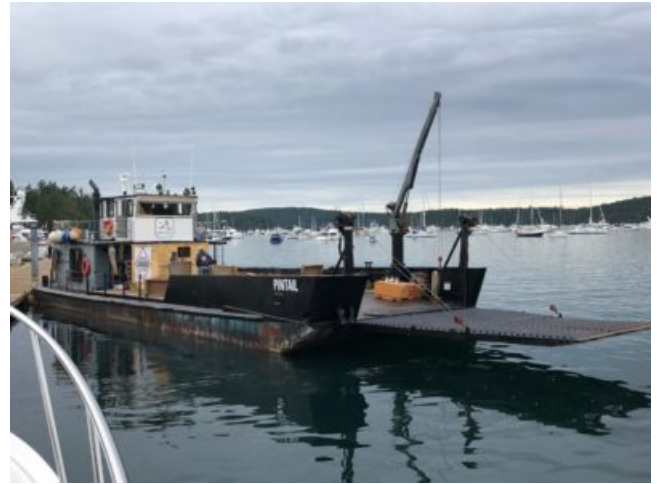
Mobile Fireworks boat