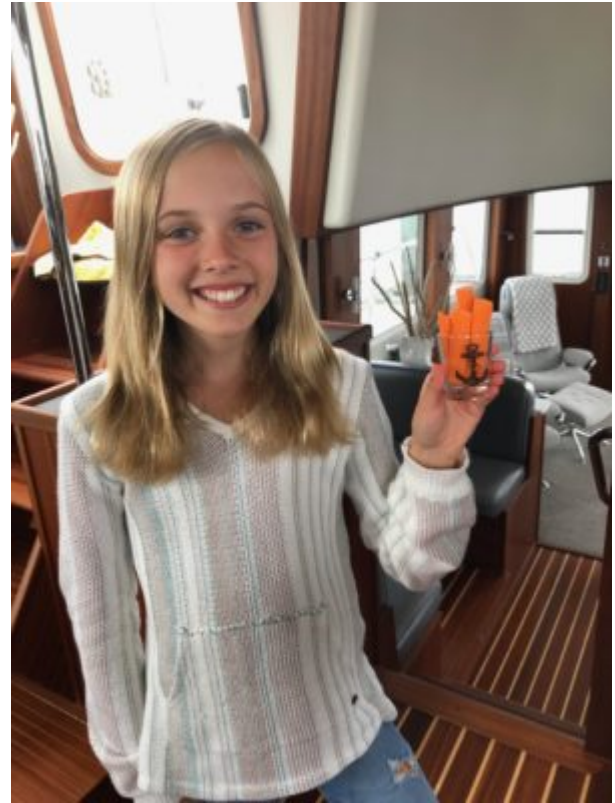
Ava made a shot glass of carrots