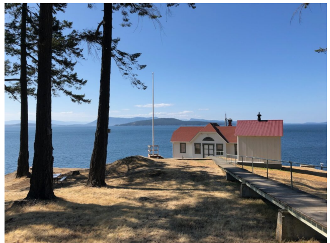
Turn Point light house