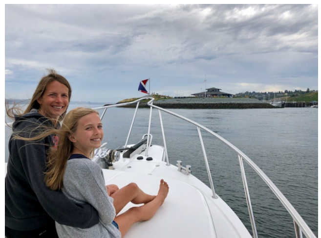
Back to Tacoma