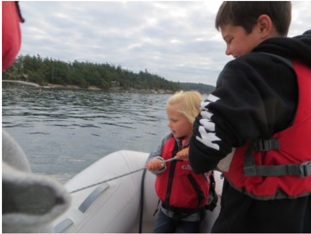
Pulling up the crab pot!