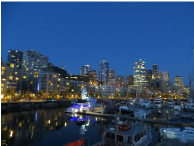
Seattle skyline from the marina