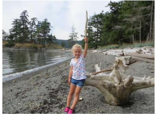
Views from the hike