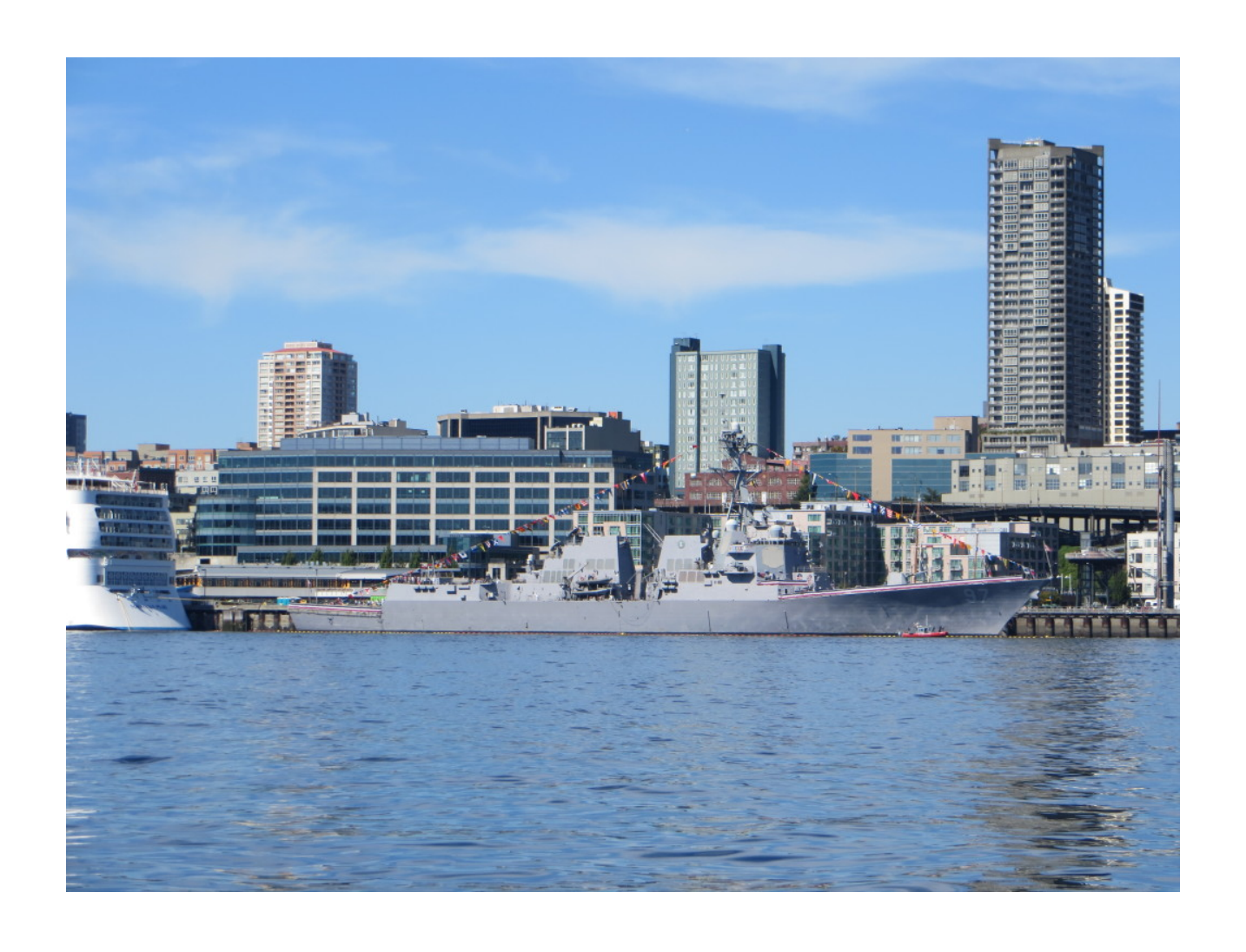
Trip Log - 73.84 nautical miles