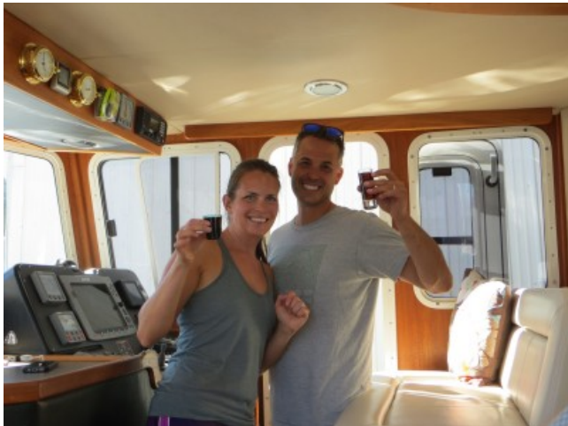
A Celebratory Drink For Cast-Off!