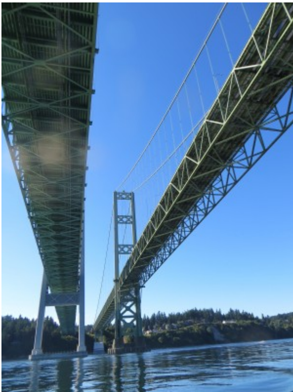
The Narrows Bridge