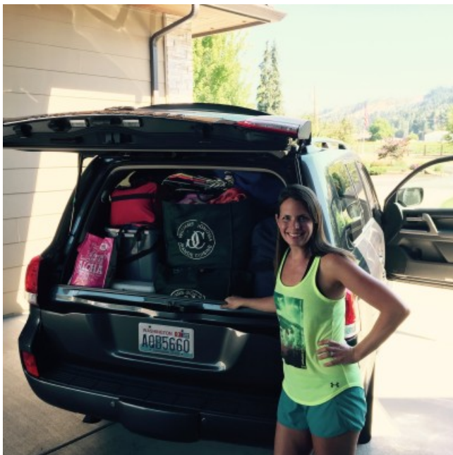
All packed up!