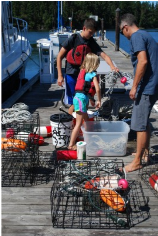
Getting ready for crabbing