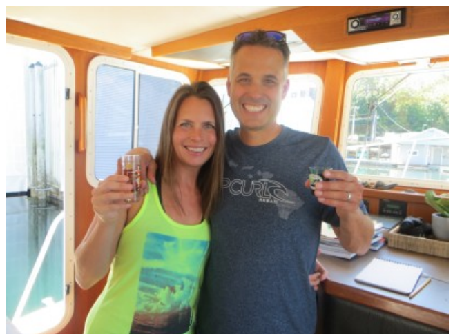
A celebration shot for the kick off