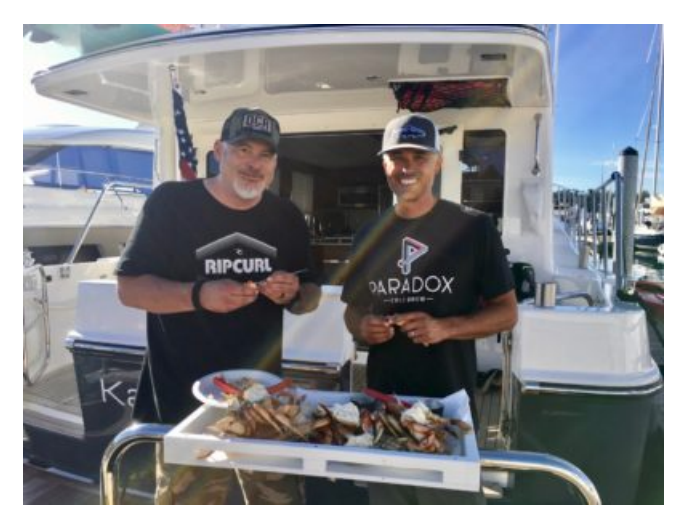
Lots of crab!