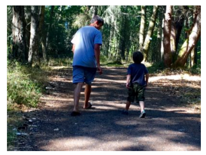
Skylar and Rogue are bonding