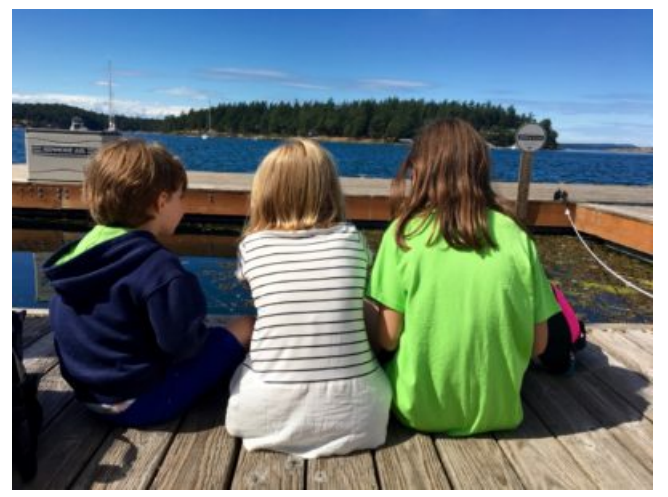
The kids waiting for the seaplane