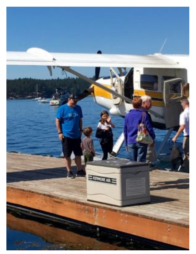
Arrival off the seaplane