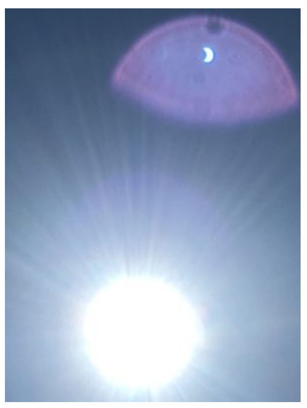
Eclipse reflection in the water