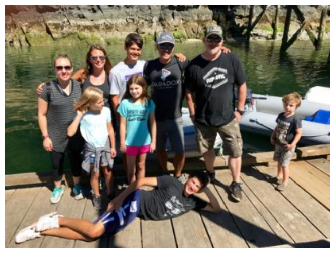
Ready for a hike!