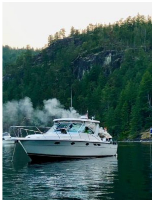
Burnin down the boat