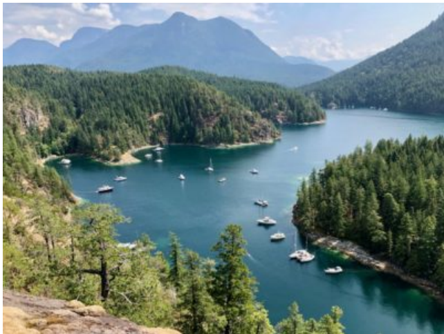
View from the top