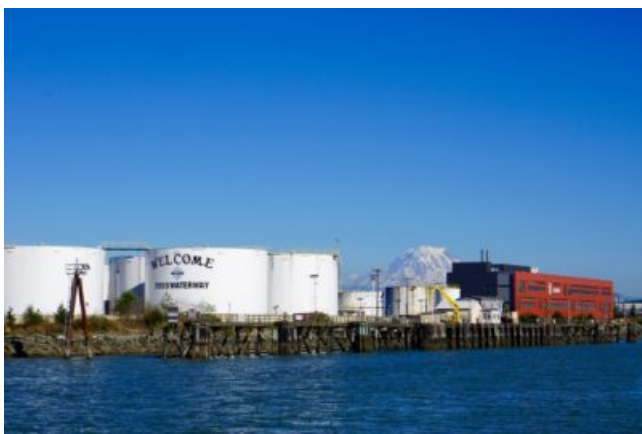
Coming into the Foss Waterway for fuel

After all the hustle to get going, we couldn't get free yet. First, we needed to go down the Foss Waterway to get fuel in the boat. 1 hour and 498 gallons later our 640 gallon fuel tanks were full. 7:25pm we actually started our trip heading south. Our plan was to make it to the Pirates Cove where we always anchor for the family reunion but that was almost 4 hours away. Boating in the dark is never fun but we decided to just keep going. The sun set over the Olympics giving us an amazing sunset as we just kept motoring into the night. Radar and GPS position showing on our charts we cruised with limited visibility until about 10pm when it truly went black. No moon light, nothing. We were totally piloting by interments but even that doesn't help you with logs in the water. We crept along at 4 knots while Julie sat out on the bow looking for anything in the water. We made it into Pirates Cove at 11:10pm and for the first time ever, anchored the boat in total darkness but the water was dead calm. It was a fun adventure but not something we want to repeat.