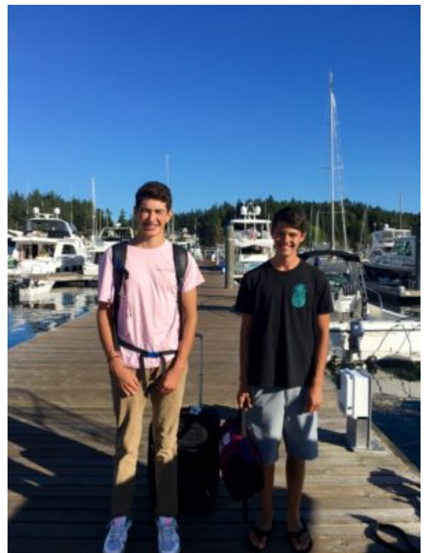
He made it!