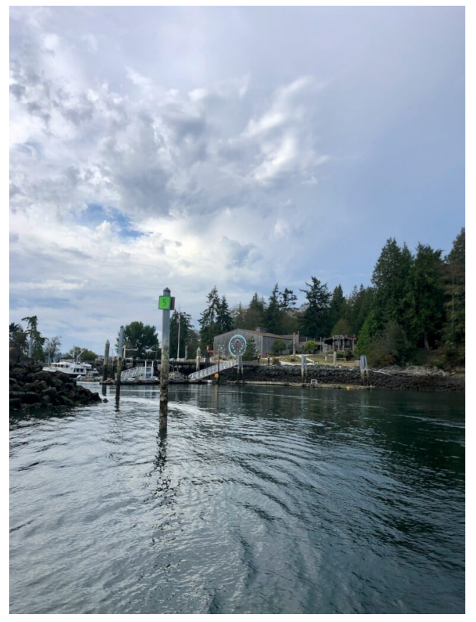
Back to Tacoma