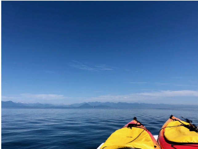
Smooth water crossing the strait